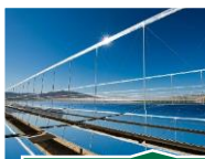
Experts in Leading Tech