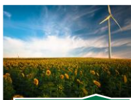
Committed to Transition